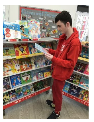
Thank you to all the parents who purchased books through our Scholastic Book Fair.