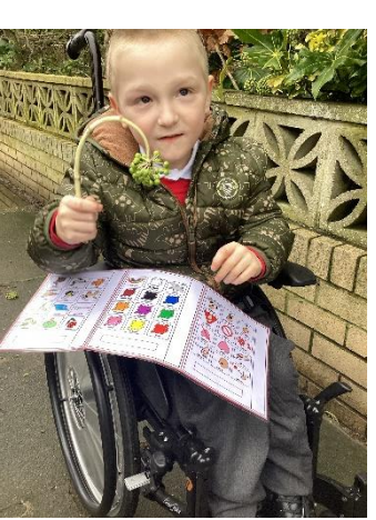
Using colour attributes to describe objects in the environment.