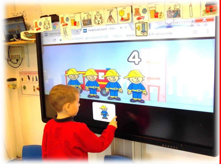
Pupils at Red Marsh School are lucky to be able to use a wide range of technology to develop their skills and understanding.