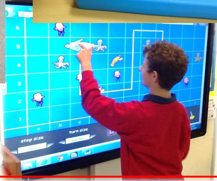
Our pupils enjoy developing their computing skills in many different ways.