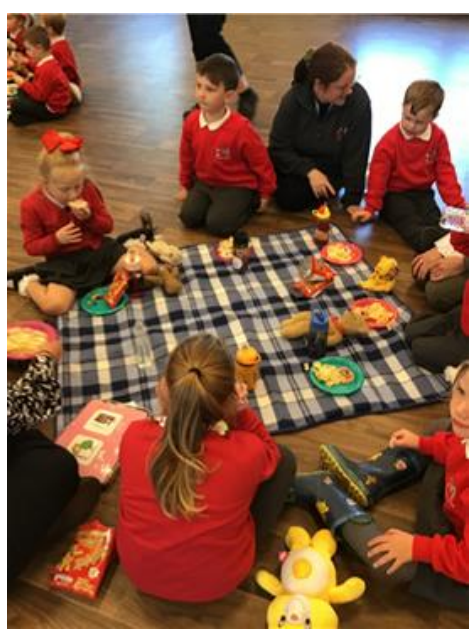
The children in Bluebells and Buttercups enjoyed sharing food with their friends.

As part of Global Awareness Week, all our wonderful pupils took part in a range of exciting activities helping them to develop their understanding and awareness of food from around the world, present and past. During this exciting week, the pupils were helped to develop a range of important citizenship skills such as communication, turn taking and group work.