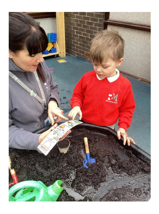
Self and co regulation is an important part of our school day as It helps the pupils settle to learn and work on their personalised targets.